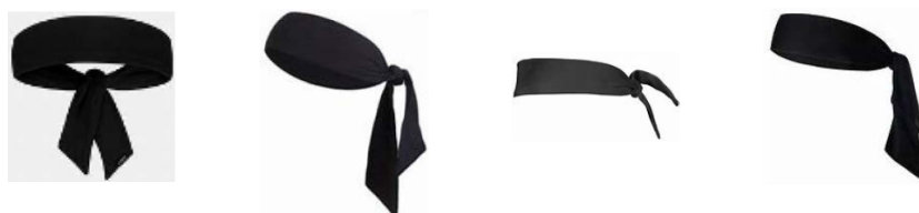
Diagram 1 Examples of scarf-style headbands

4-4 Statement: Wearing of scarf-style headbands is not permitted.