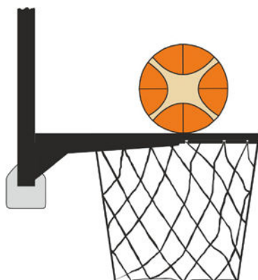
Diagram 3 Ball in contact with the ring

31-19 Statement: An interference violation is committed by a defensive or offensive player during a shot for a field goal when a player touches the basket (ring or net) or the backboard while the ball is in contact with the ring and still has a chance to enter the basket.