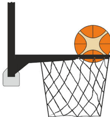
Diagram 4 Ball is within the basket

31-24 Statement: It is an interference violation if a defensive player touches the ball while the ball is within the basket.